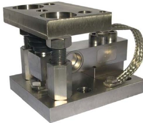
Scaime Stabiflex Ball & Cup Mounting Assembly

Kelba Australia is located at Hornsby in Sydney NSW and is the exclusive distributors of the quality Scaime products from France in Australia.