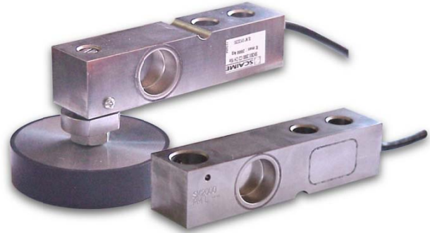
Scaime LFA Foot