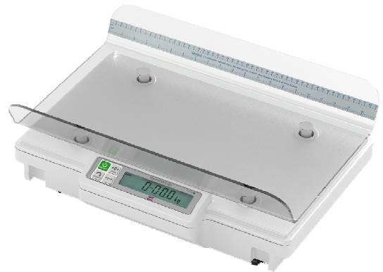
Healthweigh H610-00-2 Two-sided transparent Tray