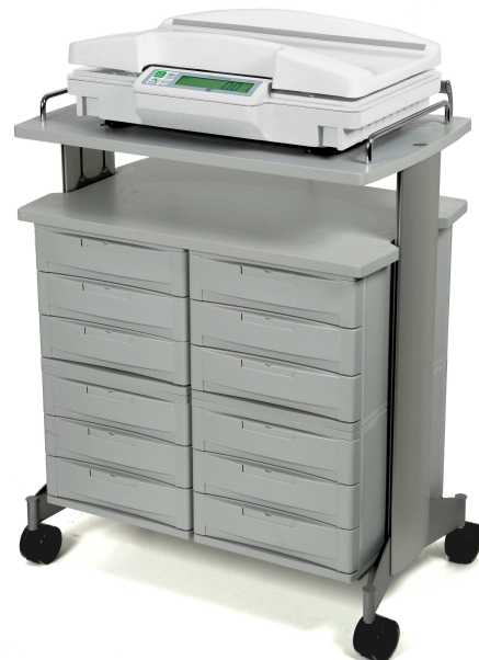
Healthweigh Baby Scale Trolley H800-00