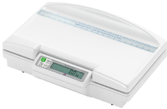
Healthweigh H610-00-1 White Opaque Tray

7 Leonard Street, Hornsby NSW 2077 Australia-P.O. Box 1664, Hornsby Westfield NSW 1635 Tel: (02) 9476 4544 • Fax: (02) 9477 7974 • Int'l +61-2 • E-mail: kelba@kelba.com • Web Site: www.kelba.com